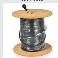
H35 BathyCorrometer to SDU Umbilical 50m 6004-0038