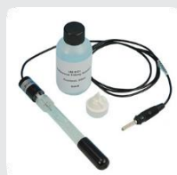
H124 Glass K-Series Reference Cell 6004-0013