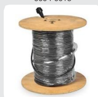
H30 BathyCorrometer to SDU Umbilical 100m 6004-0035