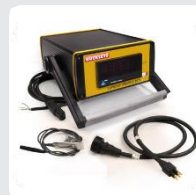
H29P Surface Display Pro' 6004-0079