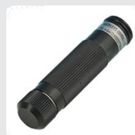
H107 K-Series Reference Cells 6004-0005