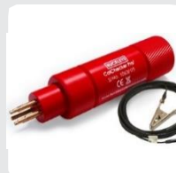
H3P CalChecker Pro' 6004-0080