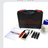
H28 BCM Calibration Kit 6004-0031