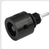
H6 Silver/Silver Chloride Half Cell 6004-0051